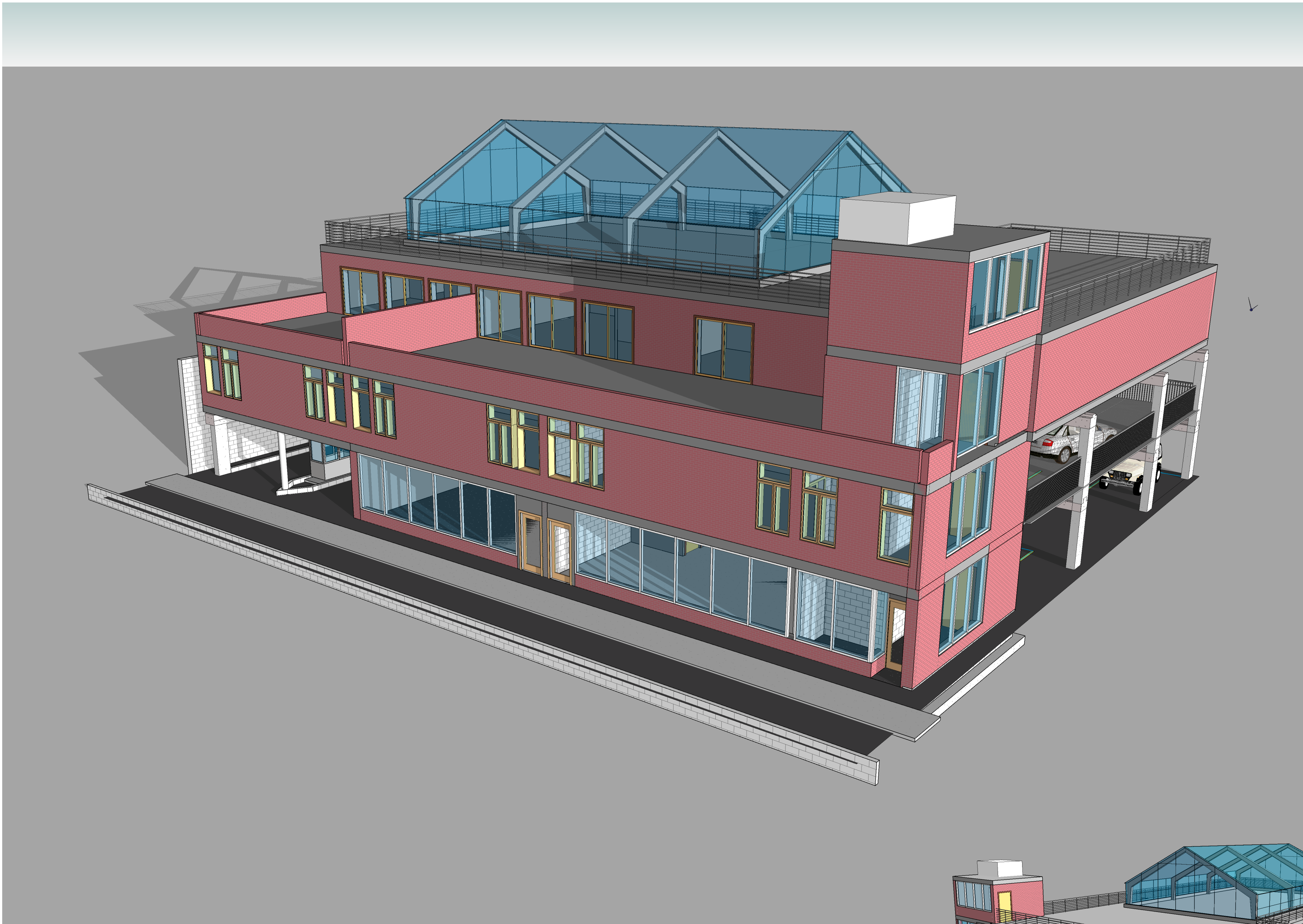
1 3D View 1